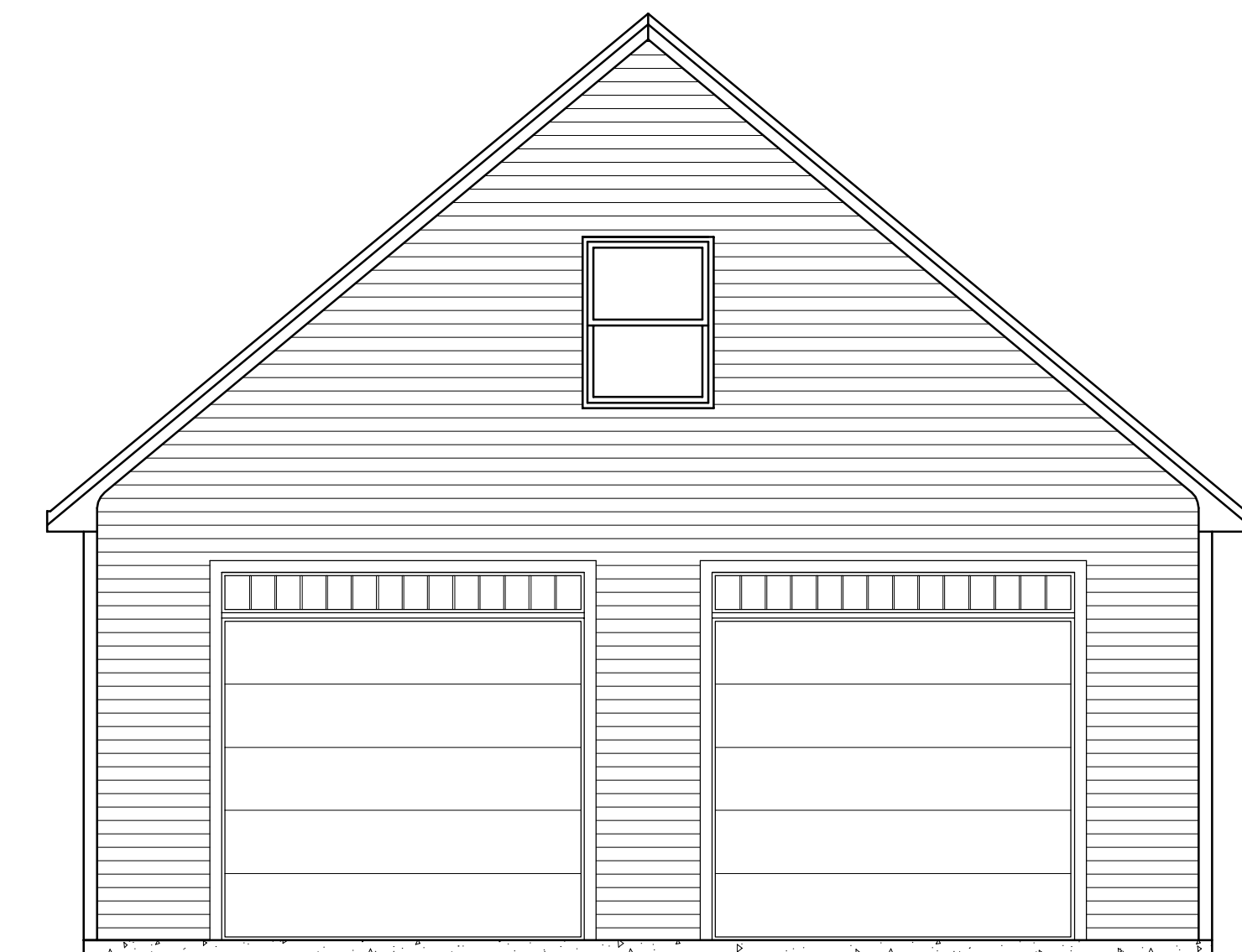
○ FRONT ELEVATION 1/4" = 1'-0"