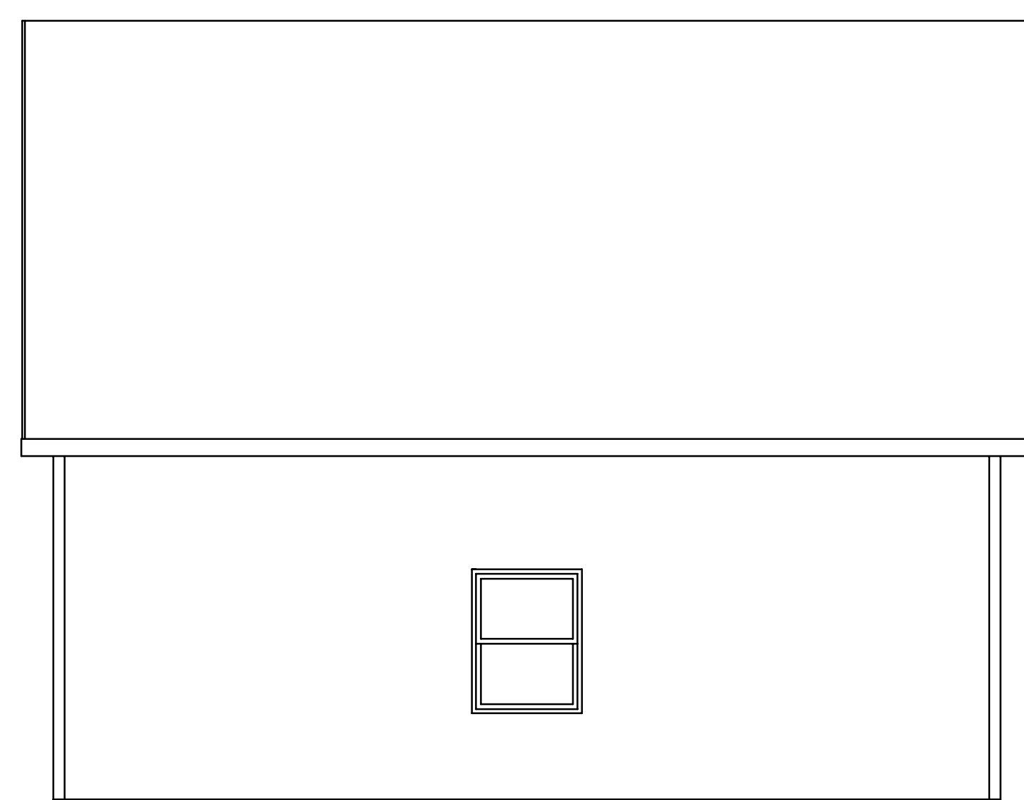
○ LEFT ELEVATION 1/4" = 1'-0"

CONTRACTOR TO VERIFY GRADE AND ALL DIMENSIONS IN FIELD BEFORE CONSTRUCTION. DESIGN SHOWN MAY DIFFER FROM ACTUAL FINISHED CONSTRUCTION. FINAL MATERIALS, WINDOW/DOOR LOCATIONS AND SIZES, TO BE DETERMINED PER OWNER/CONT. OR LOCAL CODES.